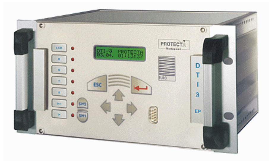
Field of application

The members of the EuroProt complex protection series are basically modular devices. The modules are assembled and configured according to the required protection functions. This information sheet describes the specialities of one of the numerous applications: the DTI-MV-EP factory configuration (and its versions). The general user's manual for the EuroProt devices is the document "EPCP-2004 EuroProt complex protection, hardware and software manual", which provides all common information to the members of the EuroProt complex protection series.