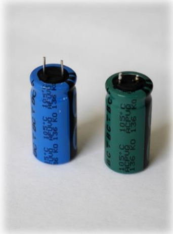
Figure 4-1 The capacitor on the right is already discolored

The following figures illustrate the different capacitor states in several photos.